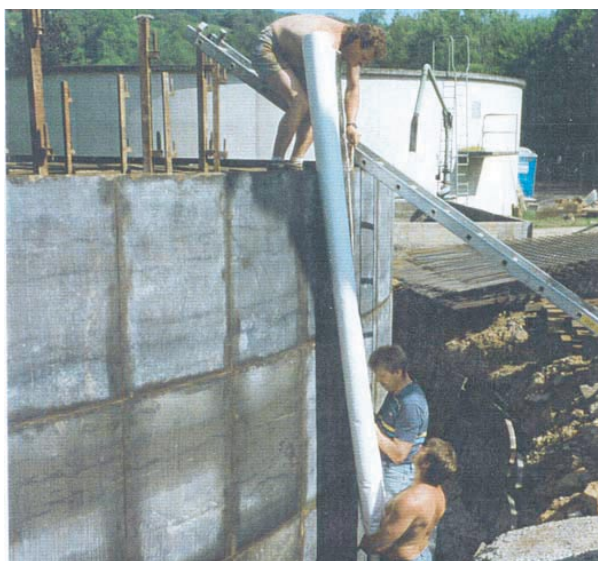
The roll is prepared for tensioning.

Formtex ® was used for this project. The liner was only used once as a new tensioning method was tested.