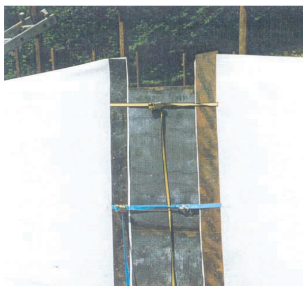
The liner is tensioned with clamps.

A new tensioning method was used: Formtex ® was rolled around the formwork and tensioned vertically.